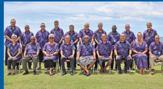
The Pacific Islands Forum Special Leaders Retreat held in Nadi, Fiji, February 2023. Theme: "Reflection, Renewal, Celebration"

6. Human Resources Division is an internal support service that manages resources for the achievement of the Ministry's strategies, ensuring key human resource management activities that involves HR planning, recruitment and selection, postings, training and development, reward and recognition.